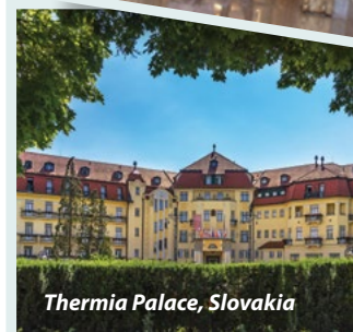
Thermia Palace, Slovakia

One of the springs is named after Beethoven, who was one of the many illustrious clients to 'take the waters' of Piestany. This incredible resort with all the latest amenities is heaven for your body and will restore your spirit.