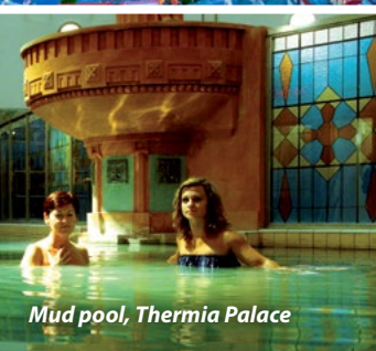
Mud pool, Thermia Palace