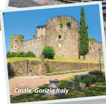
Castle, Gorizia Italy

After breakfast meet our local guide for half day tour. Enjoy the unique charm of a Renaissance Alpine city, where history is art. See architecture, nature and museums that have made Trento a cultural hotspot. Dinner at the hotel.