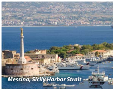
Messina, Sicily Harbor Strait