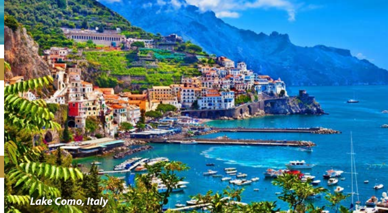
Lake Como, Italy

We depart to Gorizia on the border with Slovenia. After the cold war the city was divided in two parts, where three-fifths of its territory went to Yugoslavia. Today Gorizia and Nova Gorica (the Slovene part of the city) have no boundaries and you'll be able to walk in both countries, while staying in one city! We stay 2 nights in the modern Best Western hotel in the old city centre. Dinner at the local restaurant.