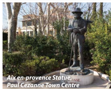
Aix en-provence Statue, JANNIE Paul Cezanne Town Centre