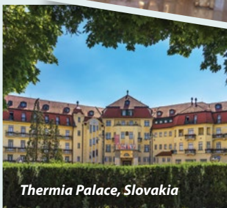
Thermia Palace, Slovakia