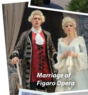
Marriage of Figaro Opera