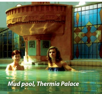
Mud pool, Thermia Palace