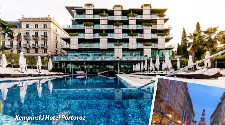
Kempinski Hotel Portoroz